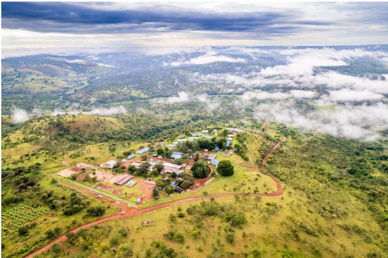
Figure 1: Overview of the Kabanga camp, located in northwestern Tanzania.