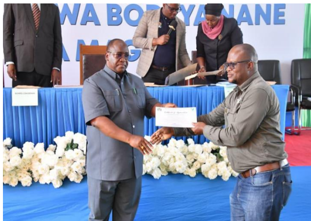
Figure 3: Kabanga General Manager receiving the Compliance Excellence Award from the Mwanza Regional Commissioner on October 15, 2025 (left); certificate of appreciation granted to the project for compliance (right).

DATA: CRU Nickel Cost Model and CRU Nickel Asset Services. Cost estimates for the Kabanga Project have been provided by Lifezone Metals using CRU price assessments for by-product credits. The chart excludes a small volume of platinum group metals (PGM) miners that produce nickel as a by-product. In USD 2024 real terms.