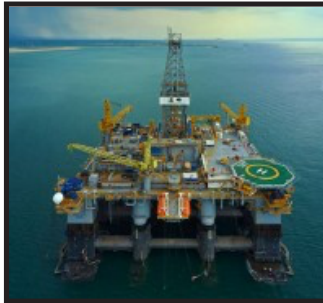
Deepwater Moored Semisubmersible