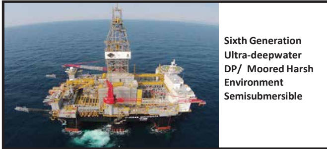
Sixth Generation Ultra-deepwater DP/ Moored Harsh Environment Semisubmersible