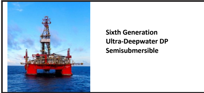
Sixth Generation Ultra-Deepwater DP Semisubmersible