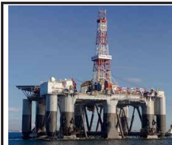
Midwater Moored Semisubmersible